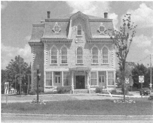
The Flint Memorial Library (1875)