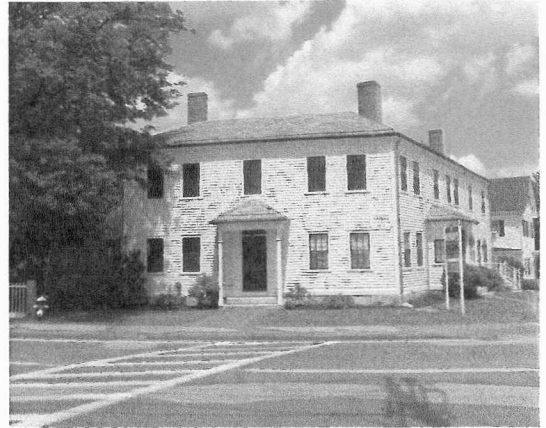
The Damon Tavern (1817)