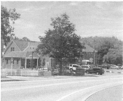
The Police/Fire Station (1969/2007)