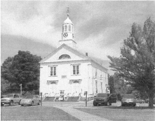
Third Meeting House (1829)

The district was formally identified under Massachusetts General Laws, Chapter 40C, (The Historic District Act) and passed by town meeting on October 7, 1993, 112 in favor, 17 opposed. Illustrated are the nine properties in the North Reading Center Village Historic District.