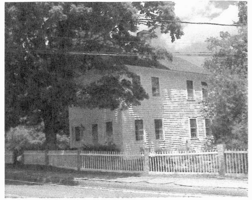
The Edwin Foster House (1838)