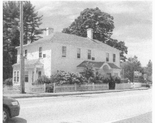
The McLean House (1818)